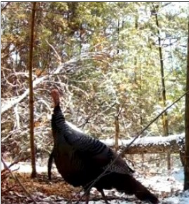
A wild turkey walked by the trail cam set up in the Jackson County Forest. The outdoor cameras can film in all types of weather.

Having access to the central forest located in Jackson County, the foundation and its partners