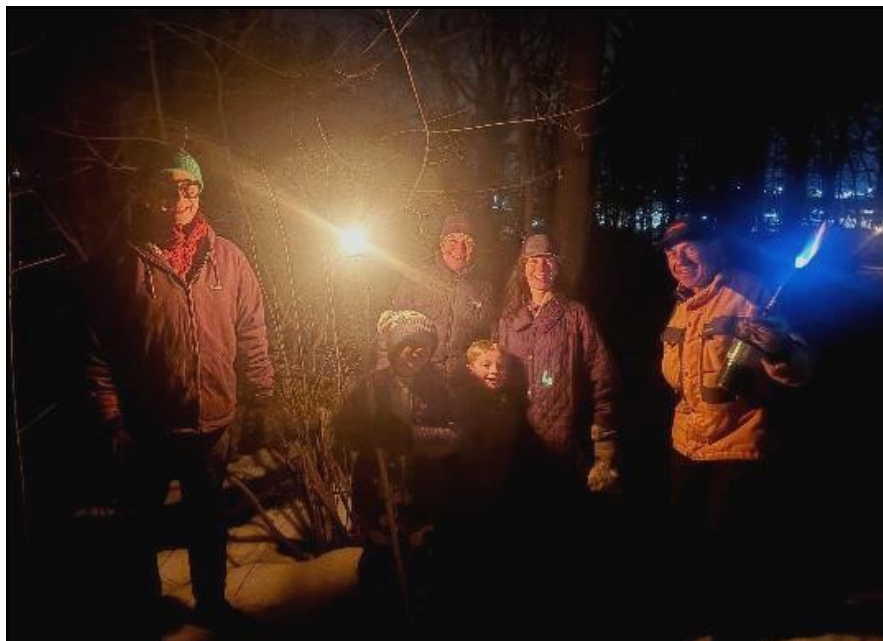
For the answer to what's happening in the photo, see page 6