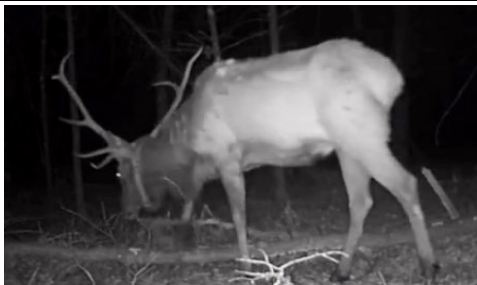
A bull elk was captured at night on a trail cam installed in the Jackson County Forest. The trail cam filming is part of a venture financed by Drop Shot Foundation.

with Vong Xiong, Jackson County game warden, about 54 youngsters were matched up with area first responders to learn how to cast, safely unhook and release a fish.