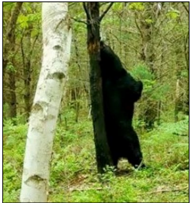
A black bear scratches an itch while a trail cam catches the action. The trail cam was located in the Jackson County Forest placed there through a partnership between Drop Shot Foundation, Jackson County Forestry and Parks and Black River Area Chamber of Commerce.

were able to get a unique viewing of deer, bears, elk cows and bulls, wolves, turkeys and numerous other wildlife in their natural habitat both day and night.